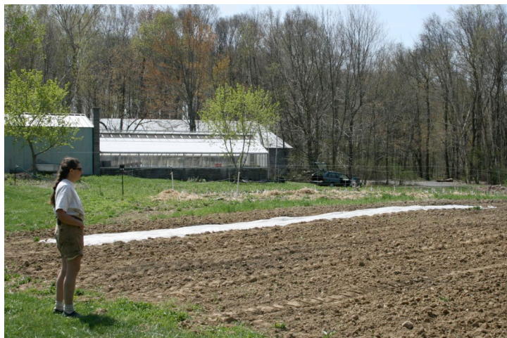
At St. Joe's in April, Kelly surveys land prepared for planting veggies. Greenhouse in background is filling up with starts -- including lots of Chinese medicinal herbs.

This seminar is expected to be the prototype for the Medicinal Herb Consortium's grower education efforts, which will be adapted for different bioregions of the country. Although our Chinese medicinal herbs have strong adaptive capacity, it's one thing to grow for conservation or to propagate the material, and another thing entirely to grow for production. That's why our growers must collaborate on a national scale for several years at the beginning of our mutual enterprise: to compare and evaluate results, and learn which regions produce the best medicinals for any given species.